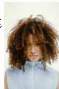
ARtec Color Depositing Shampoo

During its time the ARtec Color Depositing Shampoos were chosen as the Favorite Color Enhancing Products in the Stylist Choice Awards by the beauty industry's largest on-line web community for licensed