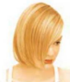
ARTec Color Depositing Shampoo

Original Publication Date: 05/20/2002 - Revised Publication Date: 04/22/11