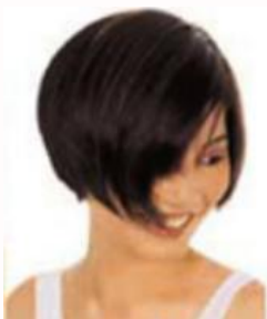
ARTec Color Depositing Shampoo